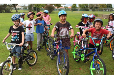
AFTER THE EASTER BREAK THERE IS ONLY 1-1/2 WEEKS LEFT FOR THE TERM. TERM 1 ENDS ON FRIDAY 13TH APRIL.